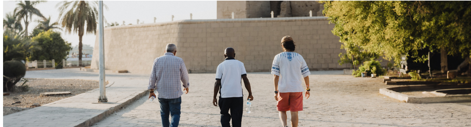
Vision trip participants visiting with a global partner in Egypt